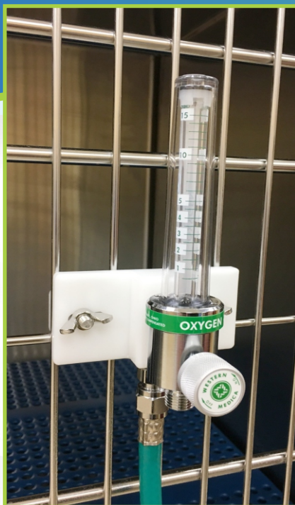
(Bracket may also be mounted to a wall)